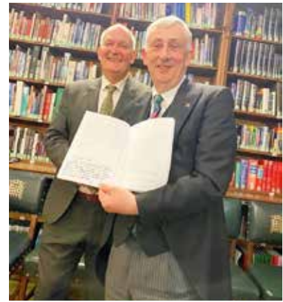
Former MP Chris Ruane presenting a copy of his paper, Be The Change You Want To See , to the Speaker of the House of Commons, Sir Lindsay Hoyle, for the House of Commons Library

To review research evidence, current best practice, extent and success of implementa-